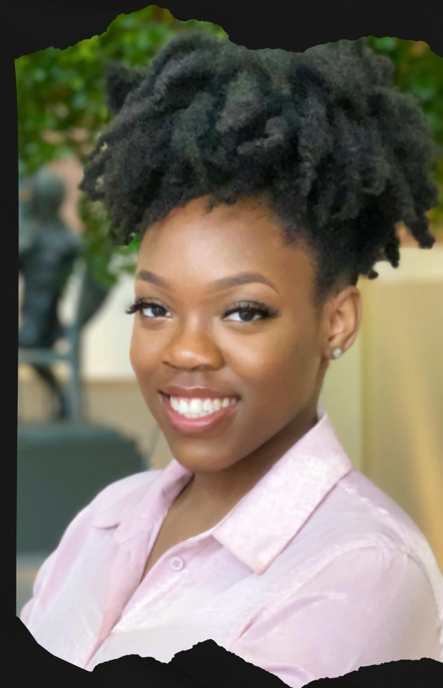
Praise O. Public Health, UMD