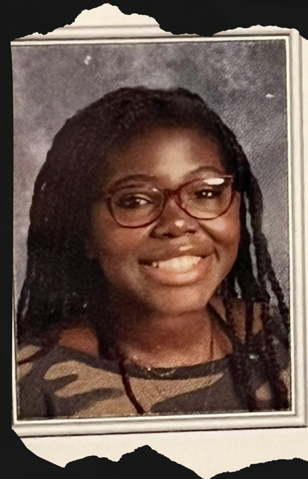
Mujidat High School Junior