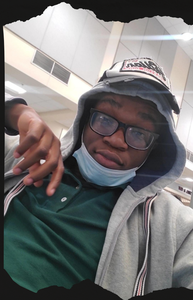
Samuel High School Junior